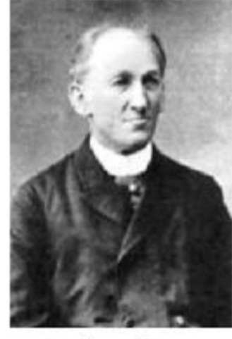
Dr. Ferdinand Roemer